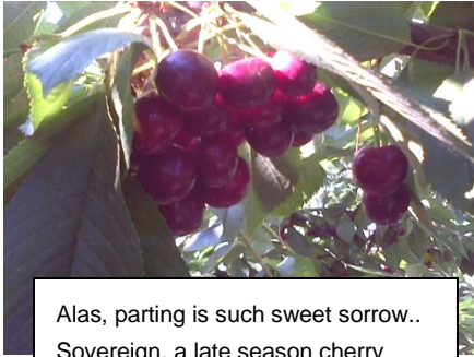
Alas, parting is such sweet sorrow.. Sovereign, a late season cherry variety in British Columbia. Cherry season in Canada will finish 1 st week of Sept.