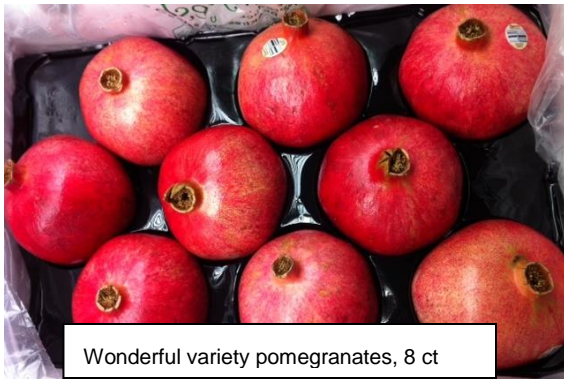
Wonderful variety pomegranates, 8 ct

Sept 5-7, AsiaWorld-Expo, Hong Kong. See you there!